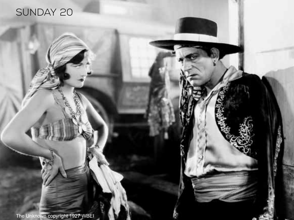
The Unknown copyright 1927 WBEl