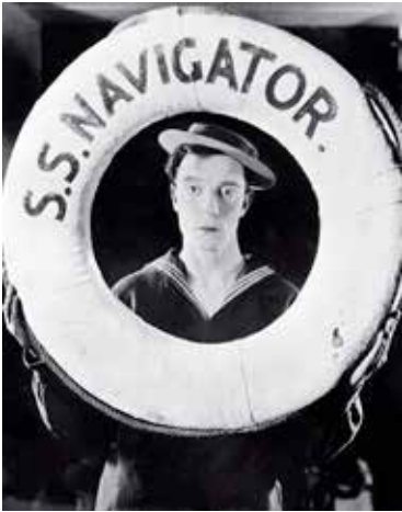
Performing live: Neil Brand